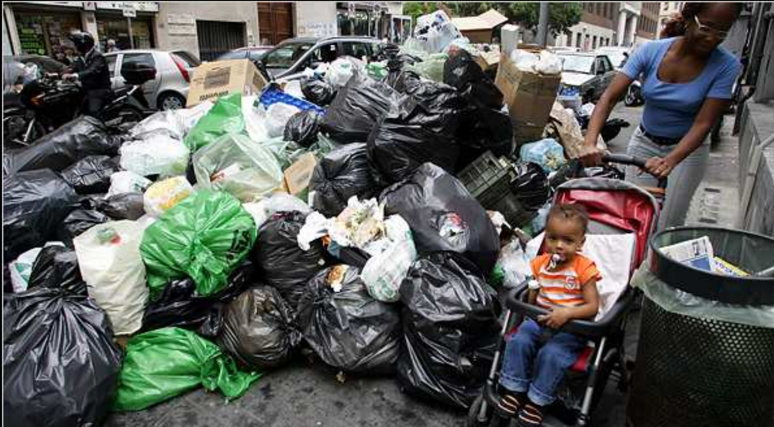
New York Times 2007